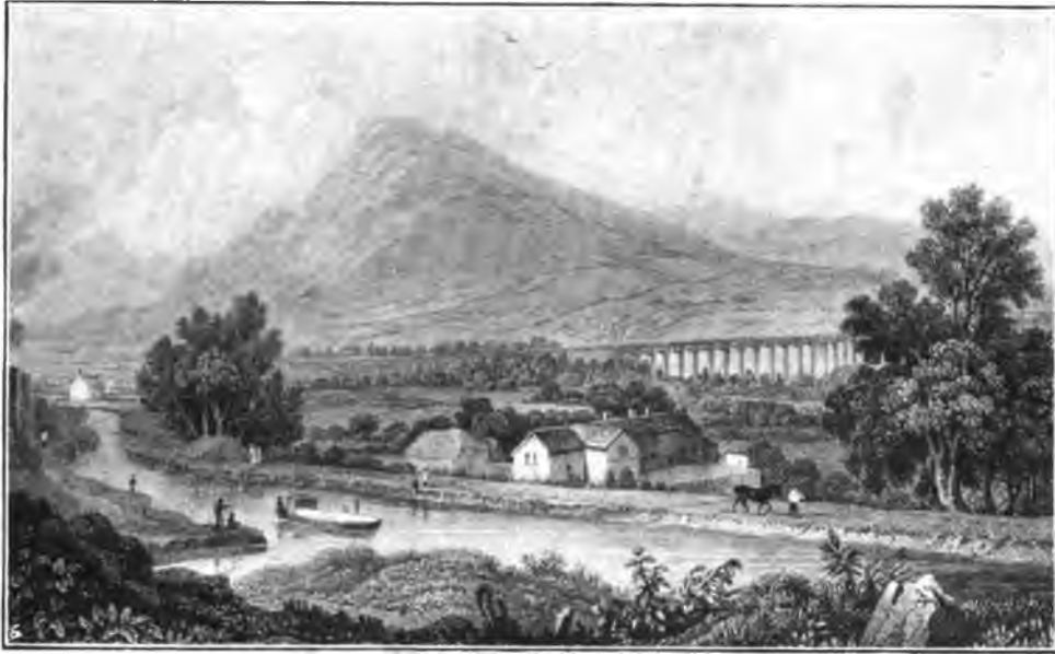
PONT Y CYSSYLLTE